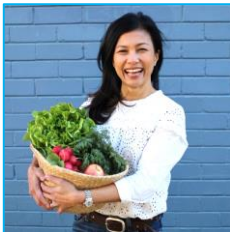
AUDRA MORRICE CELEBRITY CHEF | PRESENTER | ENTREPRENEUR | MASTERCHEF JUDGE | THE "NIGELLA OF ASIA"