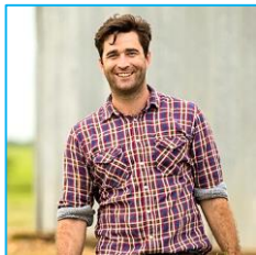
LYNTON TAPP "MAN OF THE LAND" | CELEBRITY CHEF | TV PRESENTER